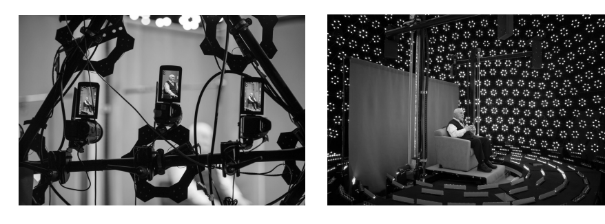
Fig. 1. Panasonic cameras used to capture multiple views of the interview.

minute continuous takes recorded on 512GB flash drives. In practice, this was not a problem, as it provided natural breaks in the interview. Scene illumination was provided by a LED-dome with smooth white light over the upper-hemisphere (Figure 2). This is a flattering neutral lighting environment that also avoids hard shadows.